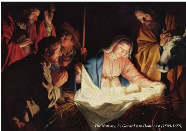
The Nativity, by Gerard van Honthorst (1590-1656).