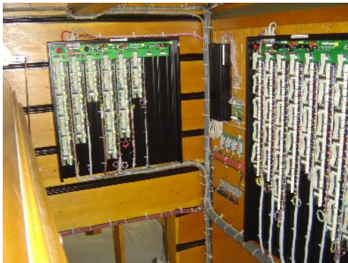
New Solid State control systems installed in the Austin AIRBOX.